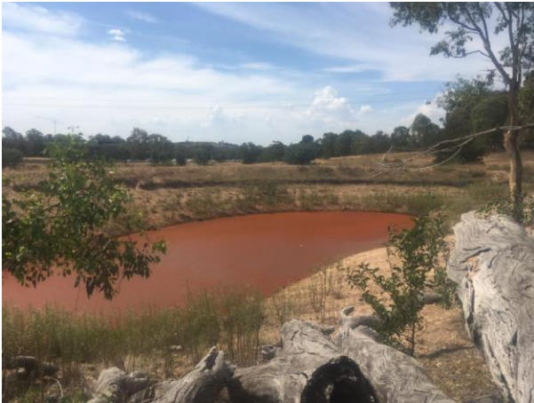
Red Algae on the dam

Parks have upgraded the fire and walking trail and the entry fencing from the Mannheim entrance.