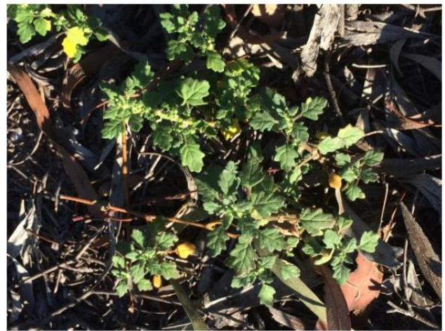
Crumbweed (Chenopodium pumilio) now known as Dysphania pumilio)

Over the past few weeks I have noticed a small herb growing in many places on the Ridge. I first saw it years ago on the Ridge, and have not seen it since. I knew it as Chenopodium pumilio , but now it is known as Dysphania pumilio . This native aromatic plant has mealy-textured leaves, and grows about 10cm high. It grows in disturbed and bare soils, and can be found in gardens and roadsides. It is now considered an exotic weed in Europe and was probably introduced via Australian wool imports.