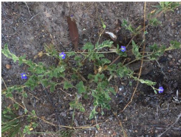
Blue Crowsfoot

Uncommon but widespread in our area, its leaves, roots and seeds were eaten by the Aborigines. It is easily distinguished from the exotic version as it is the only one with blue flowers. The exotic ones have pink flowers.