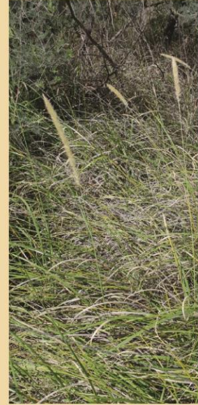
(left) seed head, (above) fibrous roots and rhizomes and dense patch of plants, (below) a large infestation in the ACT