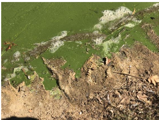
Left: Thick blue green algae on lake shore (G Patulny)

The creek below the dam revealed the lake's inability to absorb the large amount of nutrients released with the sediment from the various works upstream. Nutrients, mainly nitrates and phosphorus, found their way through the dam's base flow pipe at levels that have been not been seen since 2014. Right: Main lake body in March (G Patulny)